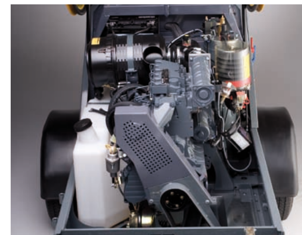
The diesel engine is designed in "in-line-configuration" that makes for easy access.