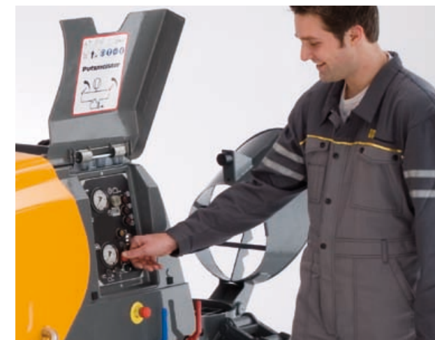
The control panel is organised and "tidy". A practical and robust flap provides protection from dirt.