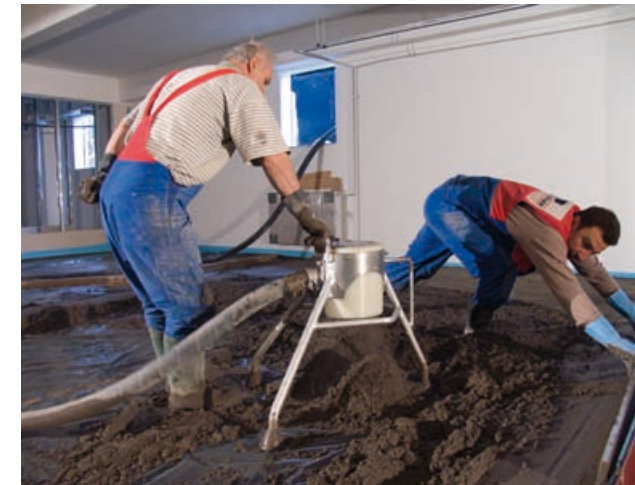
The Mixokret conveys a wide variety of materials. Floor screed and sand with a grain size of up to 8 mm, ...