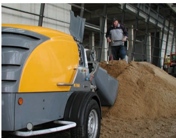
The Mixokret in the version with loader and scraper.