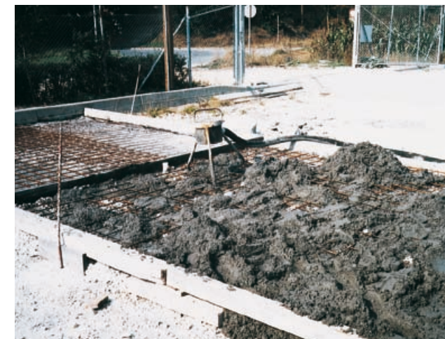
It even pumps concrete with a grain size of up to 20 mm over large distances without any problem.