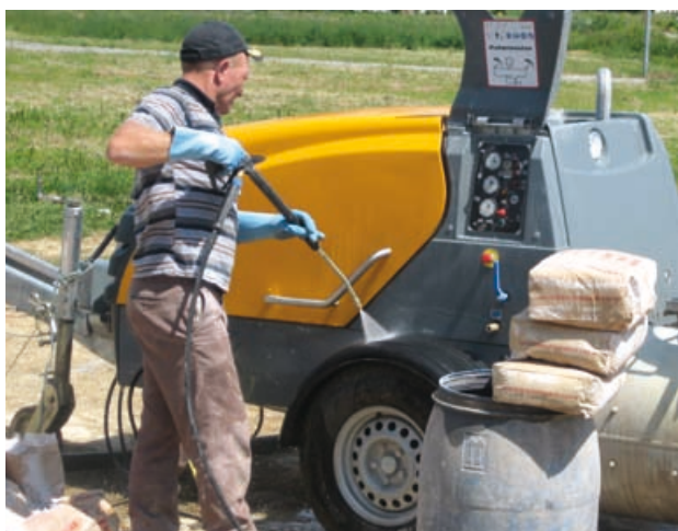
As an option, the Mixokret can also be equipped with a powerful high-pressure cleaner.