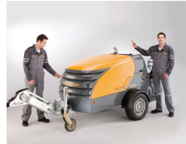
The intelligent air flow system protects both man and machine. Air is sucked in at the front, dust-free, and blown out at the rear.