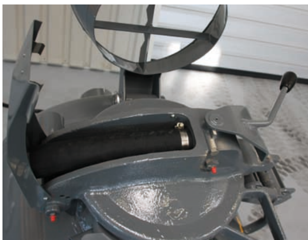
The mixing vessel vent is large, easy to operate and works reliably.