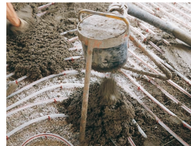
... sand and gravel of up to 16 mm grain size (e.g. for insulation filling with expanded clay).