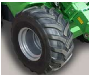
Heavy duty wheels