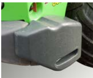
Rear side weights