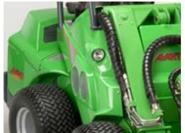
Heavy duty covers