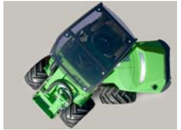
Drive release valve