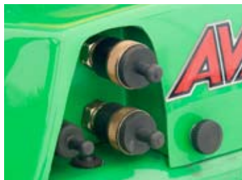
Rear auxiliary hydraulics