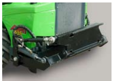
Hydraulic rear lift