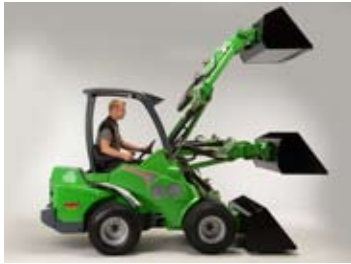
Self levelling boom