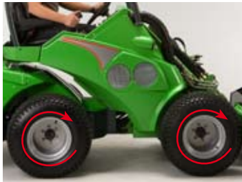
Anti slip valve