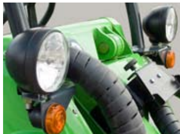
Road traffic light kit