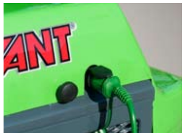
Engine block heater