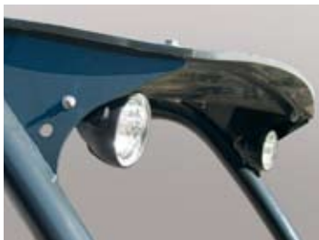
Work light kit