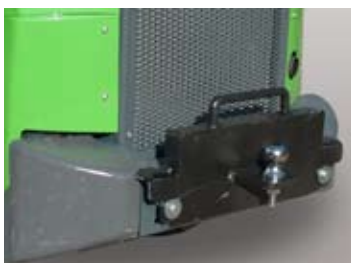
Extra weights, trailer coupling